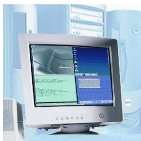
Real-time quad view

Connect a touch-screen monitor and operate, monitor, and control the connected computers.