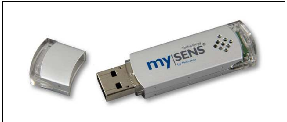
Fig. 1: GAS 86xyB demo kit