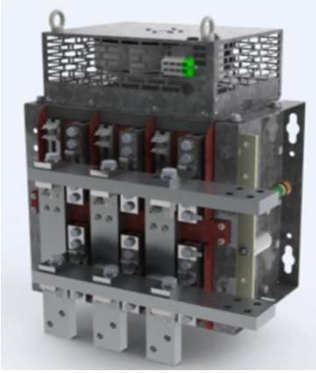
Diode Presspack stack