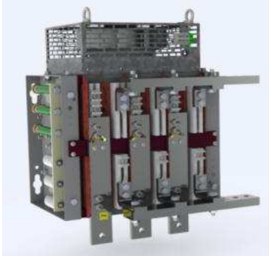
Thyristor Presspack stack