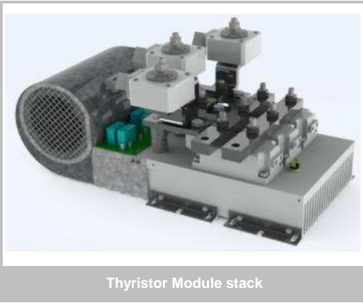
Thyristor Module stack