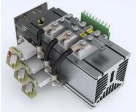
Thyristor Module stack