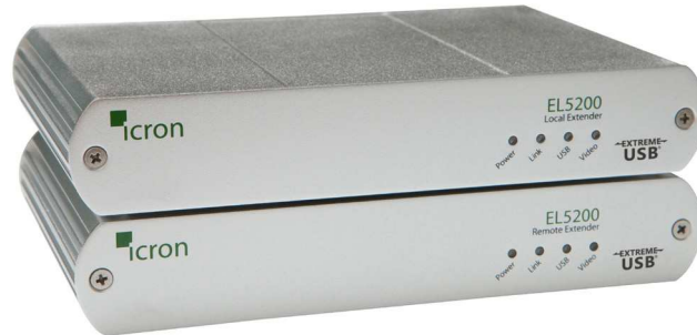
LEX (Local Extender)

The EL5200 extends both HDMI and USB 2.0 up to 100m using a single Cat 5e* cable.