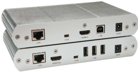
Rear view of LEX (top) and REX (bottom)