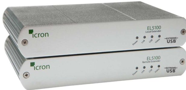
LEX (Local Extender)

The EL5100 extends both DVI and USB 2.0 up to 100m using a single Cat 5e* cable.