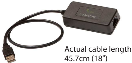
LEX (Local Extender)