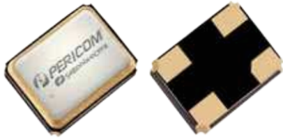
3.2 x 2.5mm Ceramic SMD