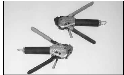
Manual Hand Tools

The Band-Master™ ATS clamping system provides quick, easy, cost-effective and highly reliable termination of braided metallic shielding or fabric braid. Two sizes of banding tools and bands (bands are also available in standard and extended lengths) allow complete flexibility in terminating EMI shielding and protective mechanical braiding to fiber optic and electrical harnesses. Glenair's complete line of Band-Master™ ATS products are in stock and ready for immediate shipment.