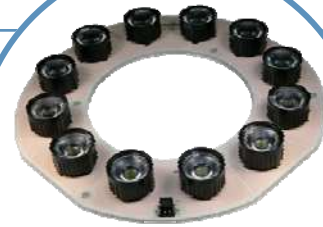
OPA741_ (23° Beam Angle)

The OPA741 Series are designed for areas where lighting intensity and reliability are essential. The light beam angle of 23° is ideal for illuminating areas close or a long distances from the device while requiring minimal space. A High Performance Heat Spreader (HPHS) is used to ensure the best heat dissipation of any light assembly in the industry.