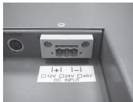
▲ Phoenix-type power input