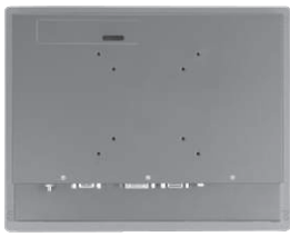
▲ Various mounting ways Panel/Wall/VESA