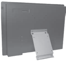
▲ Stand kit