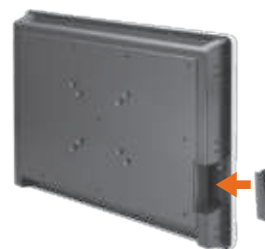
▲ CompactFlash™ slot with protective cover