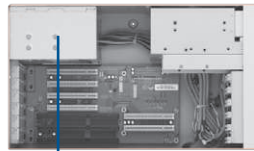
▲ Top view

Equipped with a power supply bracket securing the power supply better when the chassis is positioned in 90° orientation