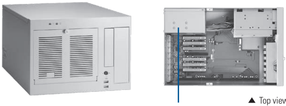
▲ Top view

Equipped with a power supply bracket securing the power supply better when the chassis is positioned in 90° orientation