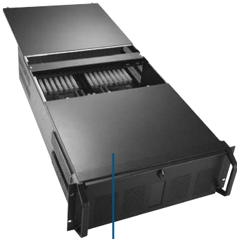
Dual top cover design for easy maintenance