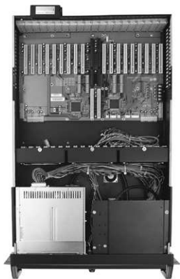
▲ Top view