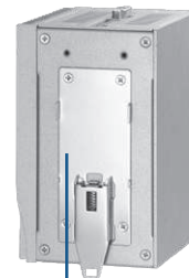
Din-rail kit ▲ Rear view