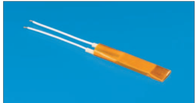
PTC Surface Heater

Please contact the factory to discuss your specific application or to discuss the availability of any options.