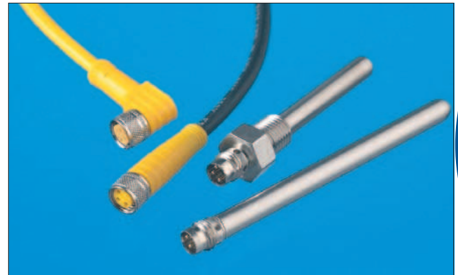
Industrial Grade Temperature Sensors

SS&C types TS and TX are ruggedized probes that seal the sensing element from the outside environment. Because they include industry standard cordsets and connectors they are extremely easy to use. The sealed end design adds an extra level of moisture resistance over previous designs. These products simplify the installation and connection of temperature sensors in the harshest applications where the protection of the sensing element from the environment is critical. With this new design, it is now possible to have a fully enclosed sensor that will provide a lifetime of accurate and reliable sensing. Please contact the factory for specific design or application information or the availability of options.