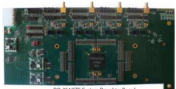
DO-254/CTS Custom Daughter Board

The design must be tested in the target device per RTCA/DO-254 specification sections 1.1 and 6.3.1. DO-254/CTS consists of a custom daughter board that contains the specific family/package or part number of the FPGA/PLD device from vendors such as Altera, Lattice, Microsemi (Actel) and Xilinx.