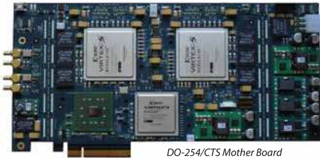
DO-254/CTS Mother Board

In compliance with the document FAA AC 20-152, verification at the FPGA level must be done to ensure completeness of testing. FPGA level verification is performed before system level verification. All FPGA level requirements verified using DO-254/CTS do not have to be verified again at the system level per RTCA/DO-254 specification sections 6.2 and 6.2.2.