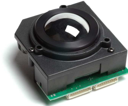
Model shown: T150BC1A

PanelPro units are also available with a translucent, colourless ball which may be backlit.