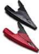
AC285-FL: Alligator Clips.