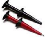
AC280-FL: Hook Clips.