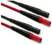
196-3523-00: Extender Leads (1.5 m).