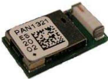
(Module with shielding)