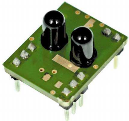
Figure 1: IRPS

It has a range of about 4 -12cm (depending on the type of reflective surface), and will not respond at all to matt black. Response time is around 10mS, and a small amount of hysteresis (about 1cm) is included to avoid 'chattering' at limit range. Vertical and horizontal axis of 'sight' versions will be available.