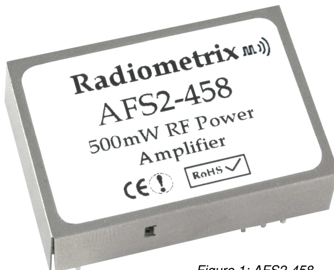
Figure 1: AFS2-458

AFS2 amplifier module is intended to increase the transmitted power of a Radiometrix multi channel TR2M transceiver module. It provides transmit and receive paths, and can be simply 'dropped into' the aerial connection. The AFS2 may be usable with other 100mW output devices, but no guarantees can be offered.