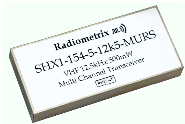
Figure 1: SHX1-154-5-12K5-MURS

It is usable for 144MHz band amateur, 151MHz US MURS and European 169MHz band high power applications.