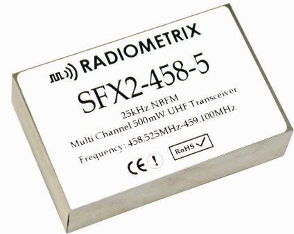
Figure 1: SFX2-458-5 transceiver

The SFX2 transceiver module offers a 500mW RF power output in the UK 458MHz band. This makes the SFX2 ideally suited to those low power applications where existing multi-channel narrow band devices like TR2M have insufficient range.