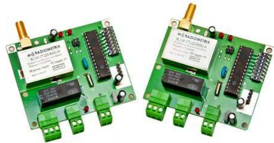
Figure 1: BL118 application boards

These simple application boards use firmware based on the BD118 remote control systems to implement a bi-directional control link. A system consists of a master board (which initiates communication burst cycles) and a slave (which responds to them). In hardware terms these boards are the same, but have different firmware loaded.