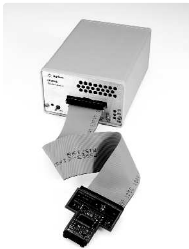
Figure 1. Agilent E5904B option 300 trace port analyzer for ARM7 and ARM9.

Quickly and accurately determine the root cause of your team's most difficult hardware and software integration problems with Agilent Technologies' powerful trace port analysis and JTAG emulation.