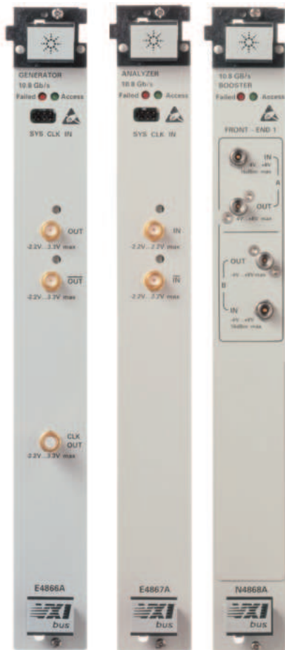
Figure 2: E4866A/E4867A/N4868A Modules