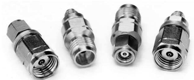
Agilent 11921E/F/G/H Adapters