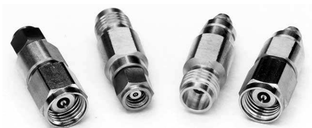
Agilent 11922A/B/C/D Adapters