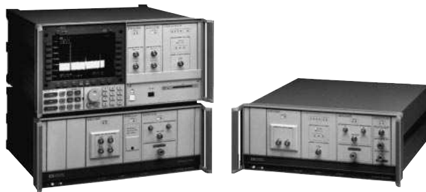
HP 71910A and 71910A Option 11 configurations