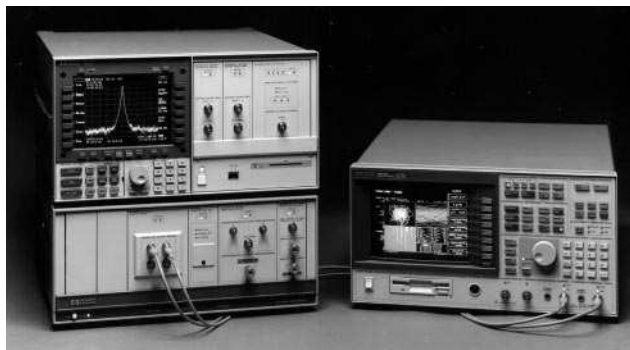
HP 71910A and HP 89410 VSA

Once a signal is located, the receiver is fixed-tuned and the wide IF bandwidths in the HP 70911A IF module are used for signal collection. The HP 70911A provides IF bandwidths up to 100 MHz (in 10% increments) and up to 70 dB IF step gain. A linear IF signal path provides good signal fidelity with standard outputs of 321.4 MHz IF and linear video. Optional outputs include 70 and 140 MHz IF, analog I/Q and demodulated FM.