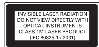
Figure 3. Classification label for 1M lasers

All laser sources comply with 21 CFR 1040.10 except for deviations pursuant to Laser Notice No. 50, dated 2001-July-26.