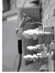
Figure 3. Cable connection.