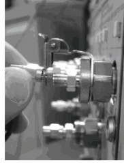
Figure 2. Shorting test cable.