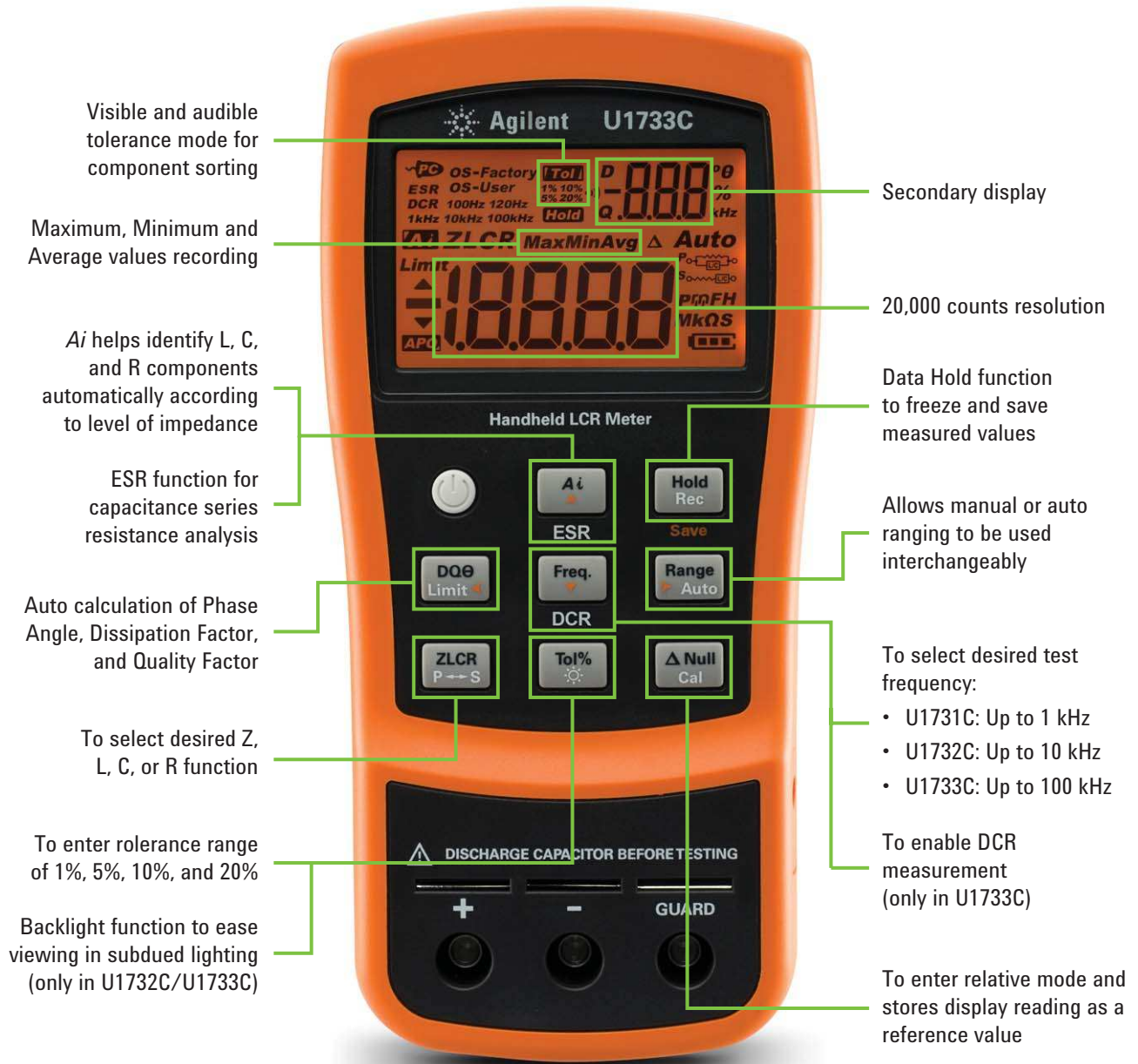
Figure 2. Front view of the U1733C