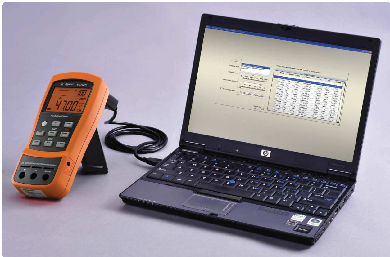
Figure 1. Automate the recording of continuous readings when you hook the U1731C/U1732C/U1733C to a PC

The handheld LCR meters allows you to test various component types, including secondary components of Dissipation Factor (D), Quality Factor (Q), and Angle Indication of Impedance ( \theta ). This new handheld series also includes other functions that result in a more detailed component analysis. For example, the built-in Equivalent Series Resistance (ESR) function helps you better understand the inherent resistance behavior typically found in capacitors across selected frequencies. DCR is a built-in DC resistance measurement that eliminates the use of a separate digital multimeter (DMM) for component test.