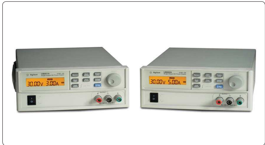
Figure 1. The U8001A 90 W and U8002A 150 W single output DC power supplies