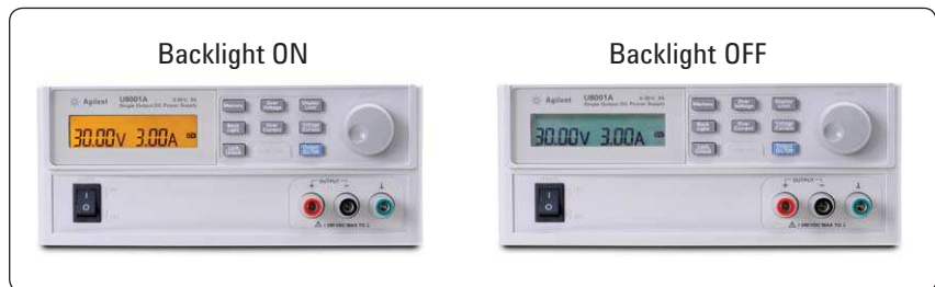
Figure 2. Backlight on/off options for LCD display