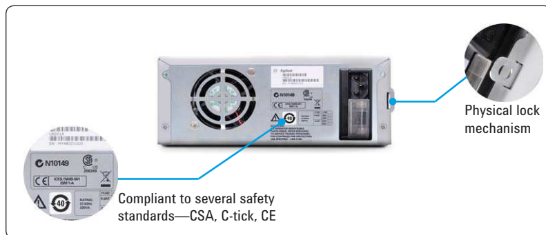
Figure 3. Safety and security features of the U8000 Series single output DC power supplies