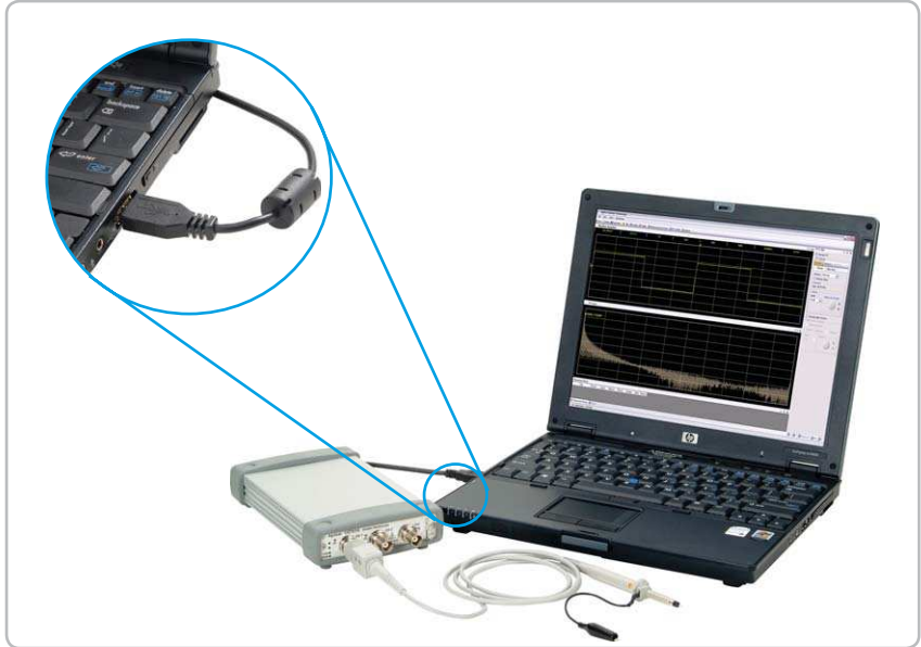
Figure 2. The U2701A and U2702A connect to the computer or laptop with a USB cable, enabling fast data transfer.

The U2701A and U2702A USB modular oscilloscopes offer analysis functions such as addition, subtraction, multiplication, division, and Fast Fourier Transform (FFT). FFT allows you to manipulate the waveform using five types of windows such as Hanning, Hamming, Blackman-Harris, Flattop, and Rectangular.