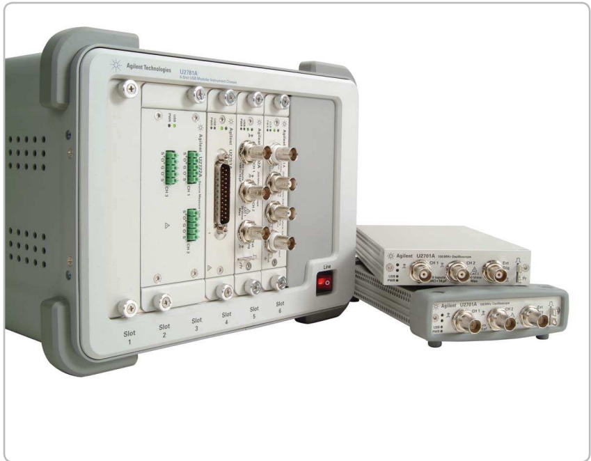
Figure 1. The dual-play capability allows the U2701A/U2702A USB modular oscilloscope to be used as a standalone unit or as part of test system in a cardcage.

The U2701A/U2702A USB modular oscilloscopes are equipped with High-Speed USB 2.0 interface for easy setup and plug-and-play. This ease of use makes the oscilloscopes ideal for the education, design validation and manufacturing industries.