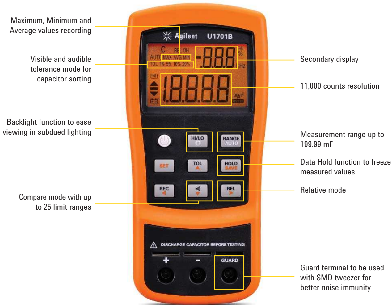
Figure 2. U1701B front view