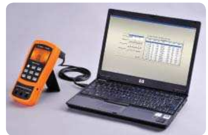
Figure 1. Automate the recording of continuous readings when you hook the U1701B to a PC

The handheld capacitance meter comes in a robust overmold and tested to stringent industrial standards. Each capacitance meter is also sealed with a three-year warranty and the assurance that you can test your components with confidence.