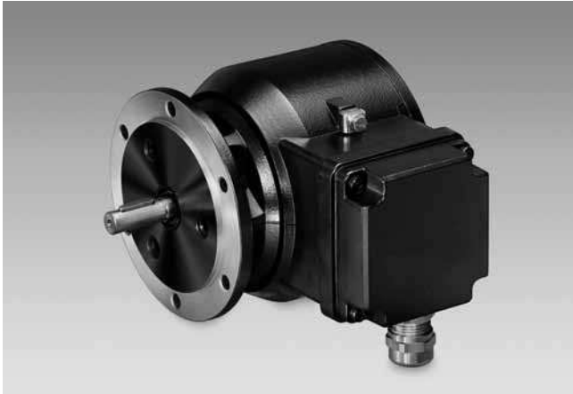
EEx OG 9 S