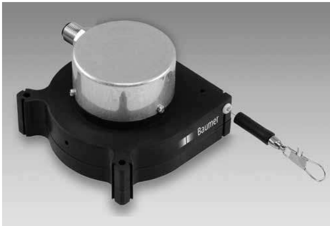
BMMS K50 SSI with connector M12