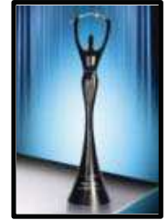
Electra Award 2005