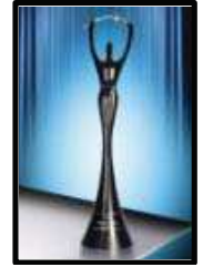
Electra Award 2005